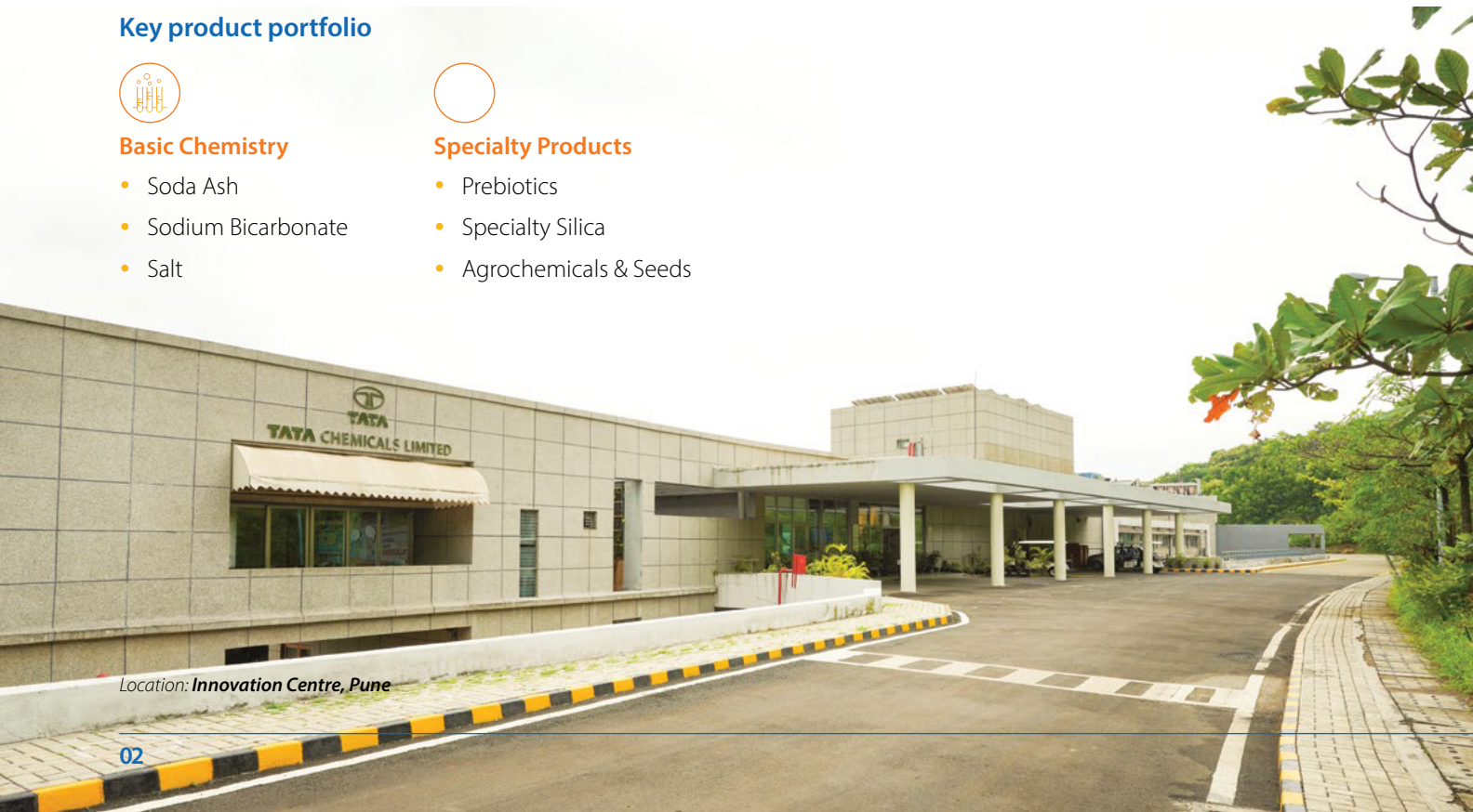
Location: Innovation Centre, Pune

Africa, Middle East, Indian Sub-Continent, South East Asia, China